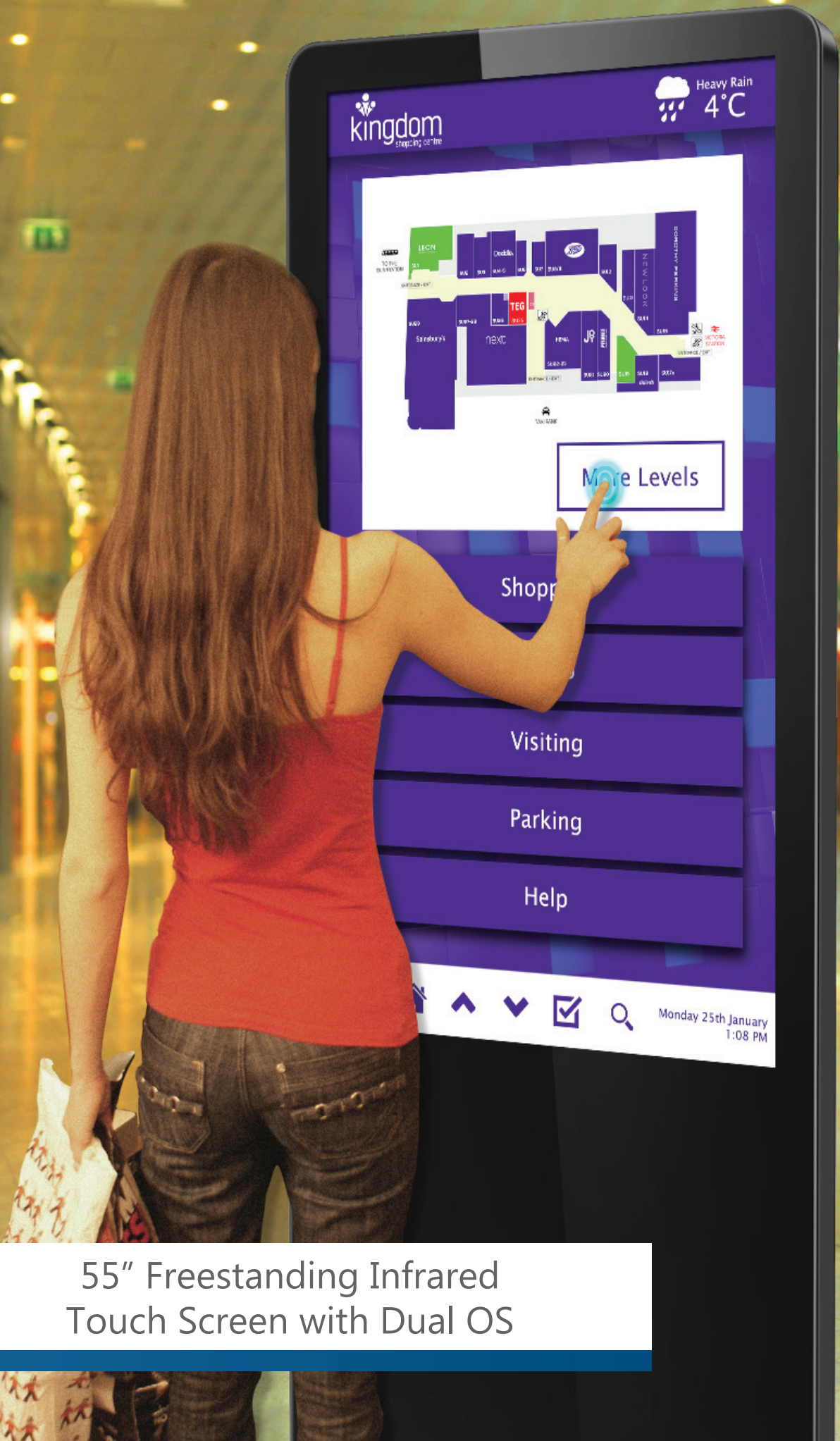
55" Freestanding Infrared Touch Screen with Dual OS